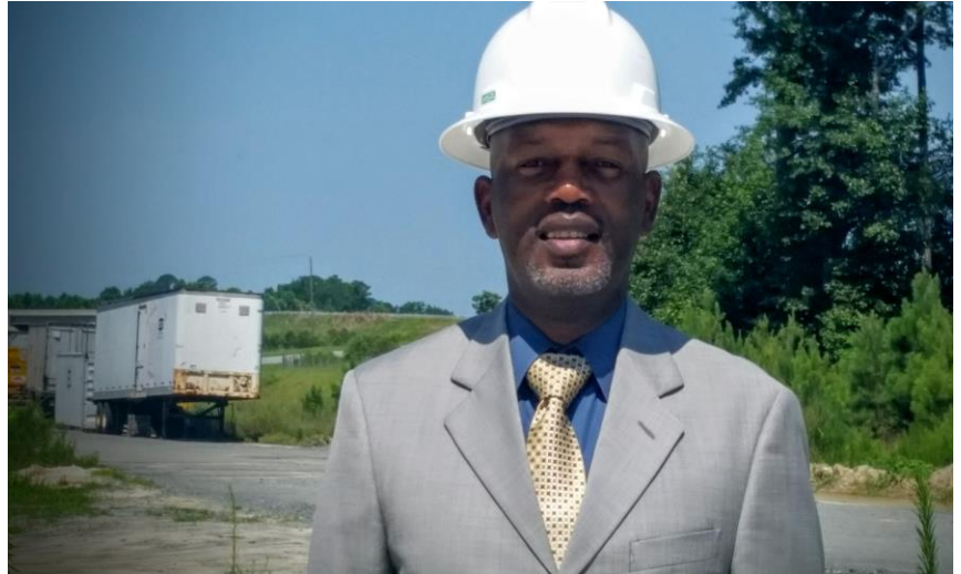
Carolina Group Contracting